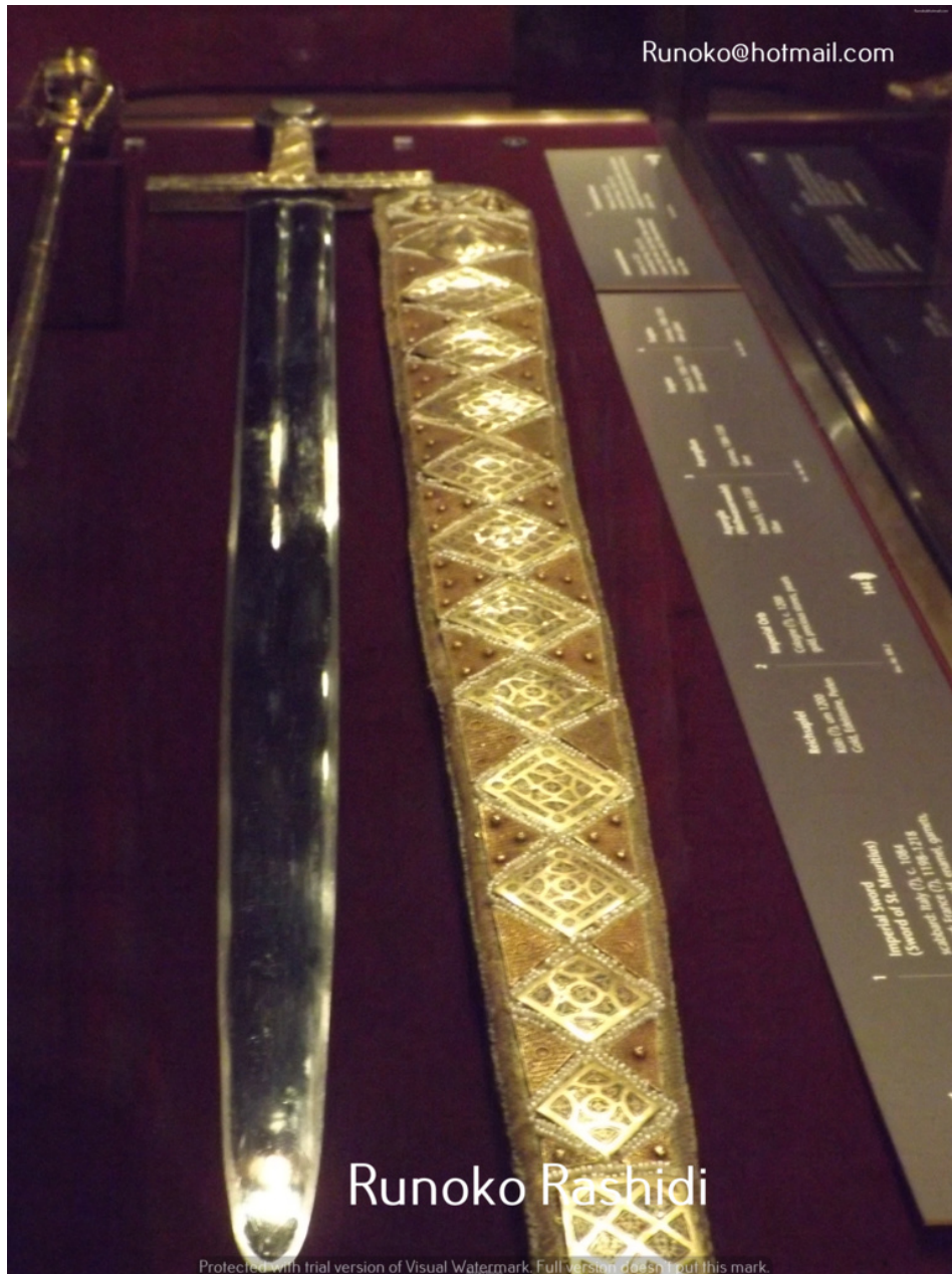
A scabbard sword, believed to be Saint Maurice's, now at the Imperial Treasury in Vienna, Austria.