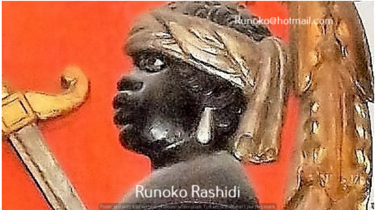
Saint Maurice with sword, facing left.