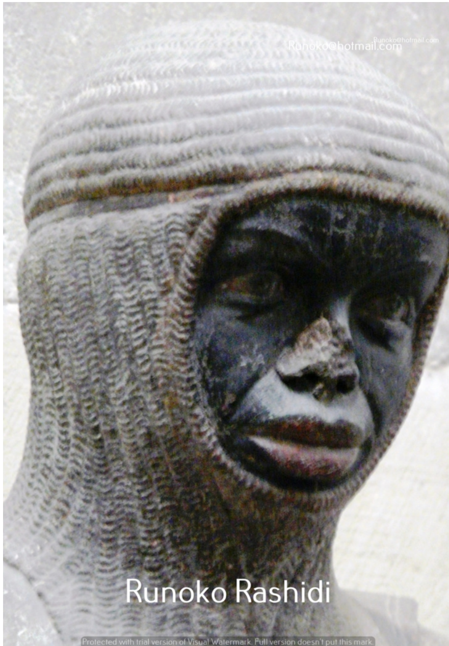
1240 statue of Saint Maurice in the cathedral in Magdeburg, Germany.