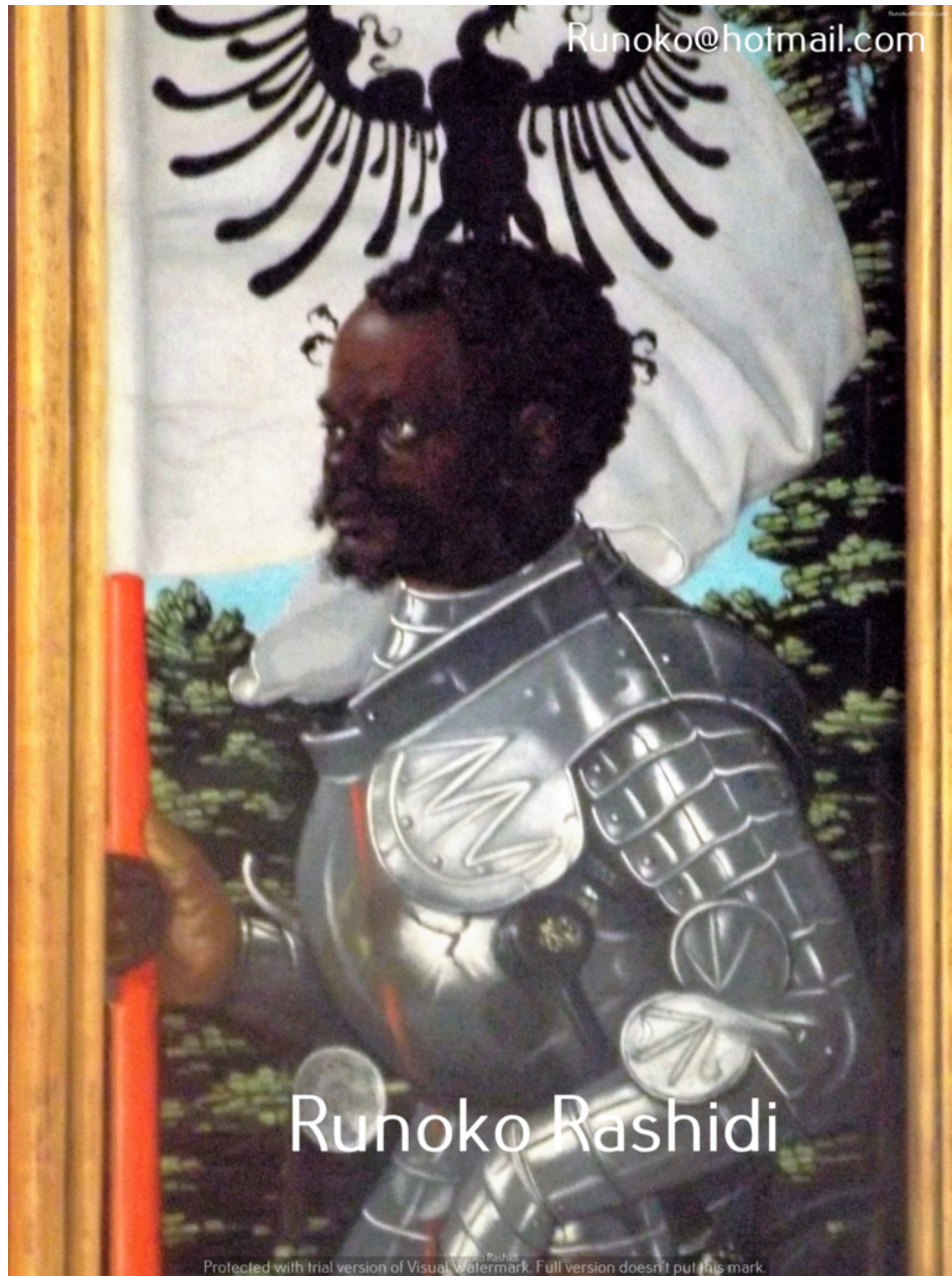
Saint Maurice in shining armor.