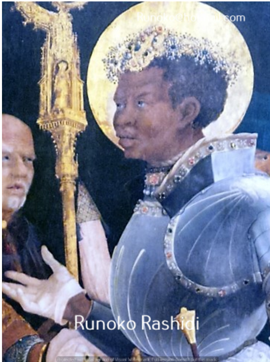
Christian martyrs Saint Erasmus (left) and Saint Maurice (right) in heaven.