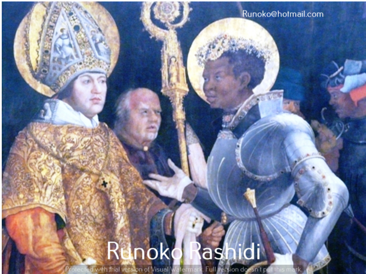
Painting of the Christian martyrs Saint Maurice and Saint Erasmus in heaven painted by the German painter Matthias Grunewald around 1500 (location: Vienna, Austria art museum).