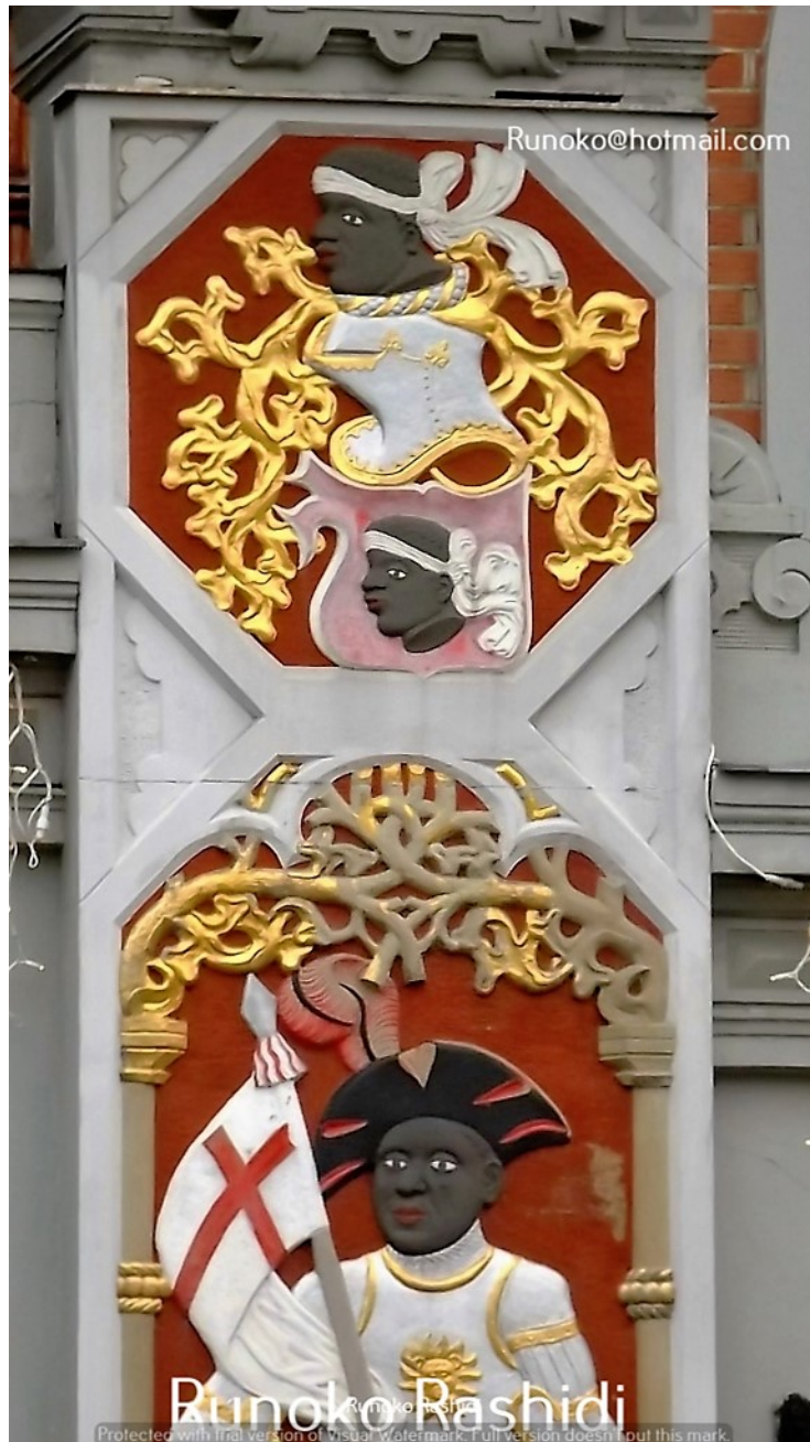
The image of Saint Maurice, and the two heads of Moors above him.