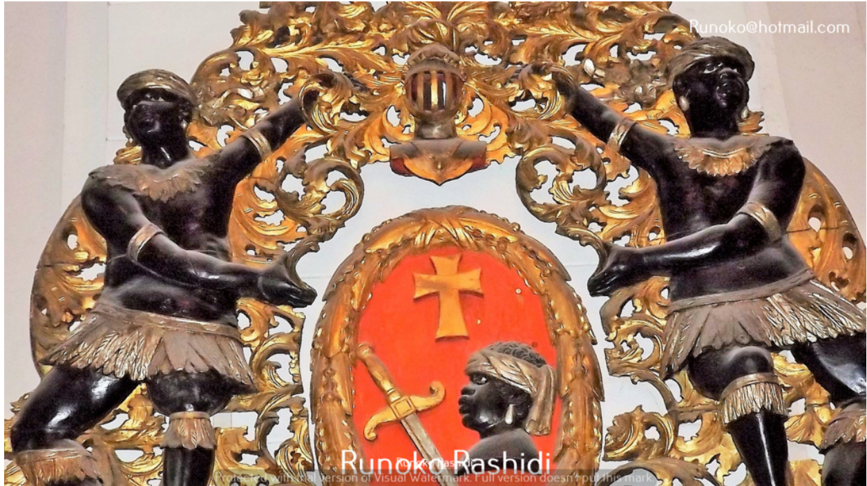
Image also from Riga, one of the most spectacular of all of the images depicting Saint Maurice, an altarpiece, several hundred years old, depicting Saint Maurice with sword and cross and on each side with splendid images of Moors on each side of him.