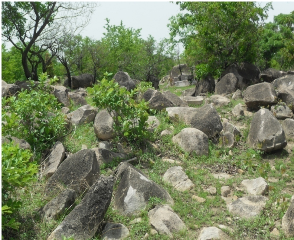
Fig.2. a view of the topography showing the undulating nature of the landscape, making the pursuit of slave raiders on horses difficult.

It does appear that, this song suggests how a victim could pretend to be running away into the bush, but in so doing, lures a slave raider into an unfamiliar terrain. The basic point in this strategy, as informants recounted, is that victims were often more familiar with the topography than their predators. The memories of these strategies suggest that subaltern groups did not always remain passive but devised innovative strategies to lessen the impact of captivity and to ensure that their entire people and cultures were not completely obliterated. In addition to the landscape, local architecture facilitated resistance against enslavement within these cultures.