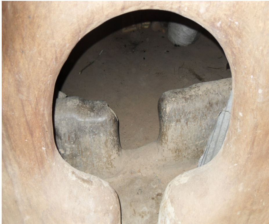
Fig. 6. A photo showing a narrow entrance designed to make entry difficult for people not familiar with the environment.