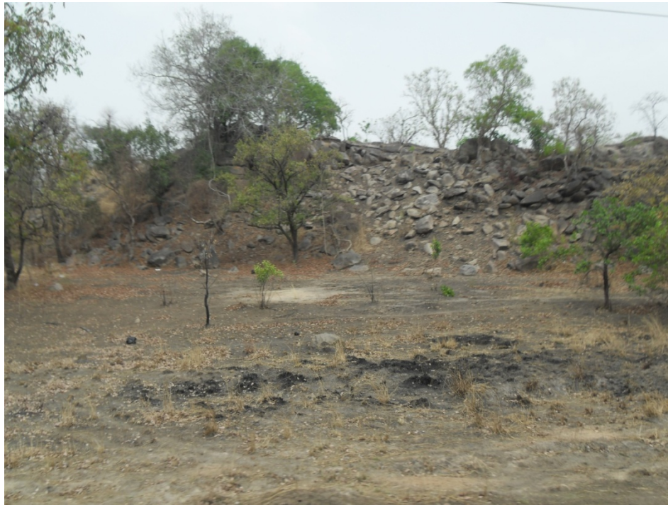
Fig. 3.A photo showing part of the topography.