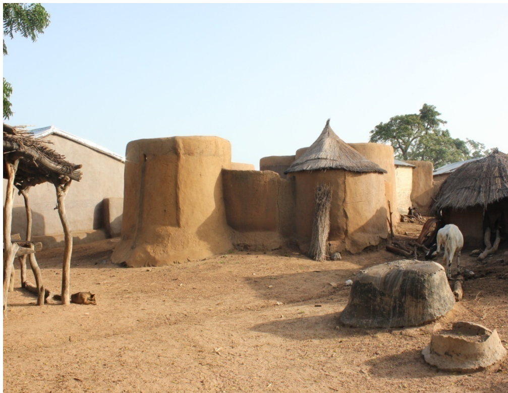
Fig. 4.A photo showing a household compound.

The architecture motif is significant in that we see a similar pattern within Balsa and Kasena cultures, as it became one of the defensive strategies in how they resisted human kidnapping for enslavement. The chief of Nakong, Joseph Banape Afagache, from whose compound the photo in Figure 4 below was taken, recounted how, as a child, he was told of how raiders who terrorized their community were resisted by the innovative use of these building strategies. According to him, their houses were constructed such that they were practically impregnable and difficult for attackers to access. Although people are now beginning to design houses using modern models, in the past, the main building material was sand and clay mixed with cow dung, dry grass and water. These materials were mixed together and kneaded thoroughly before being used to build. A particular compound could comprise between three and six round shaped houses connected by a wall and a small entrance (as shown in Fig. 4).