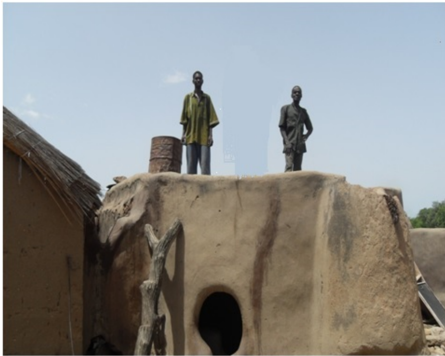
Fig.5 A photo showing how people were posted on roof tops to alert the community on the approach of slave raiders.