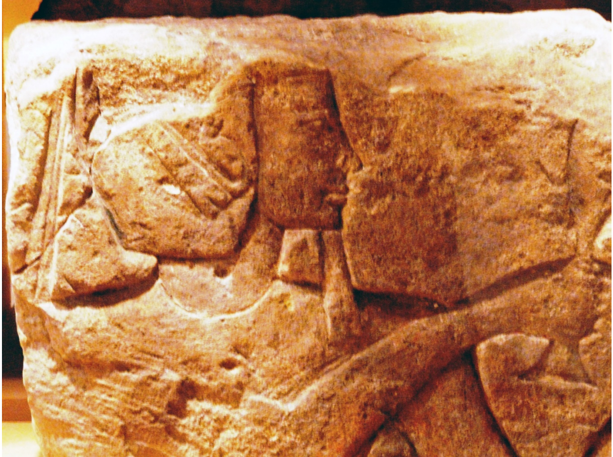
Usermare Ramses II. National Museum, Warsaw, Poland.