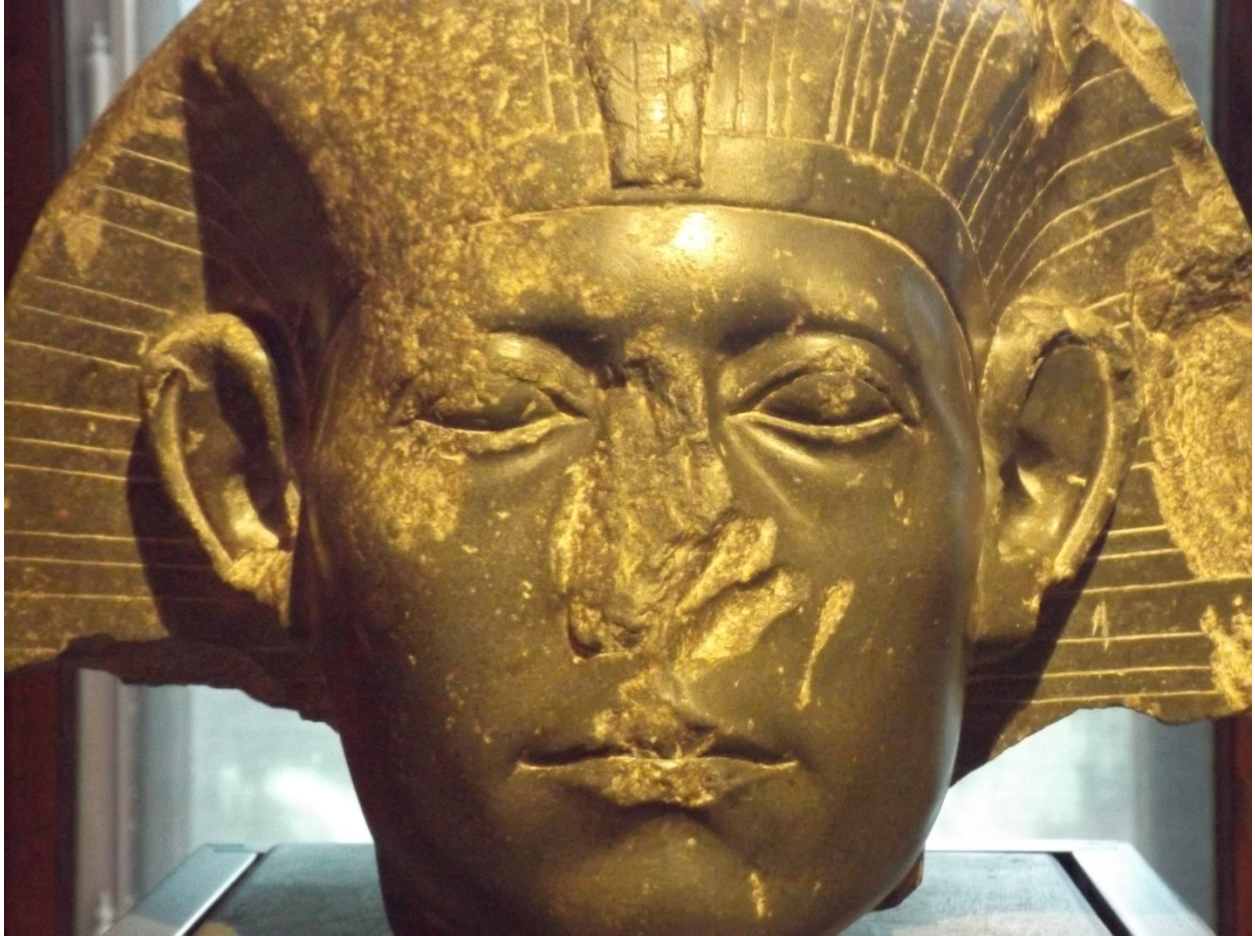
Seneferibre, circa 1850 BCE. Kunsthistorisches Museum, Vienna, Austria.