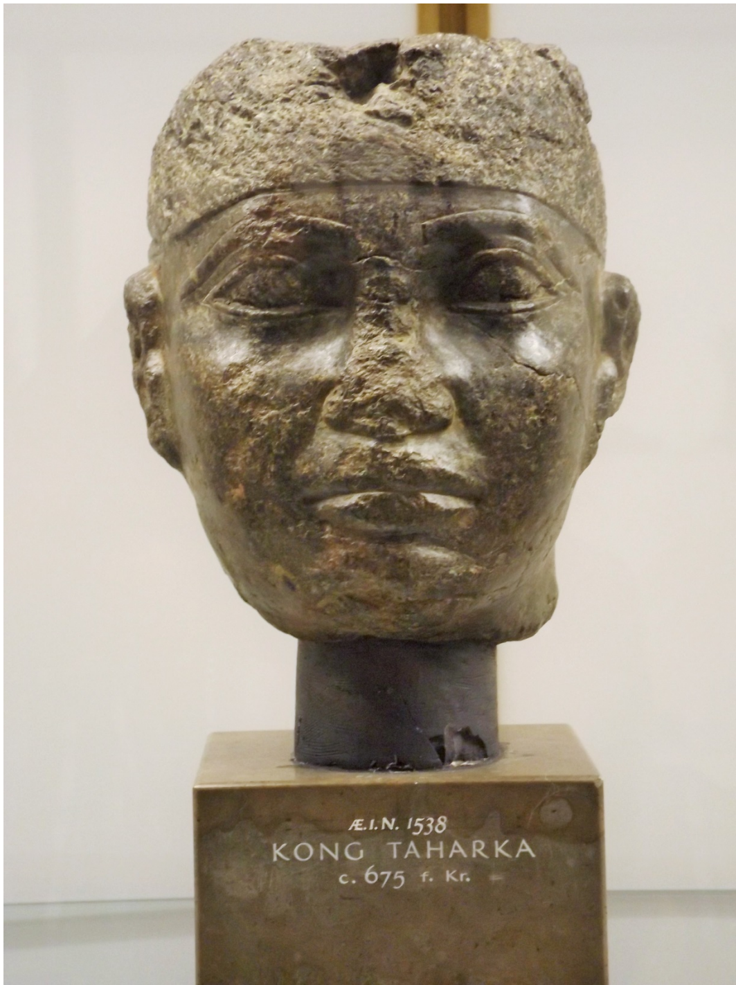
King Taharqa. Circa 690 BCE. Ny Carlsberg Glyptotek, Copenhagen, Denmark.