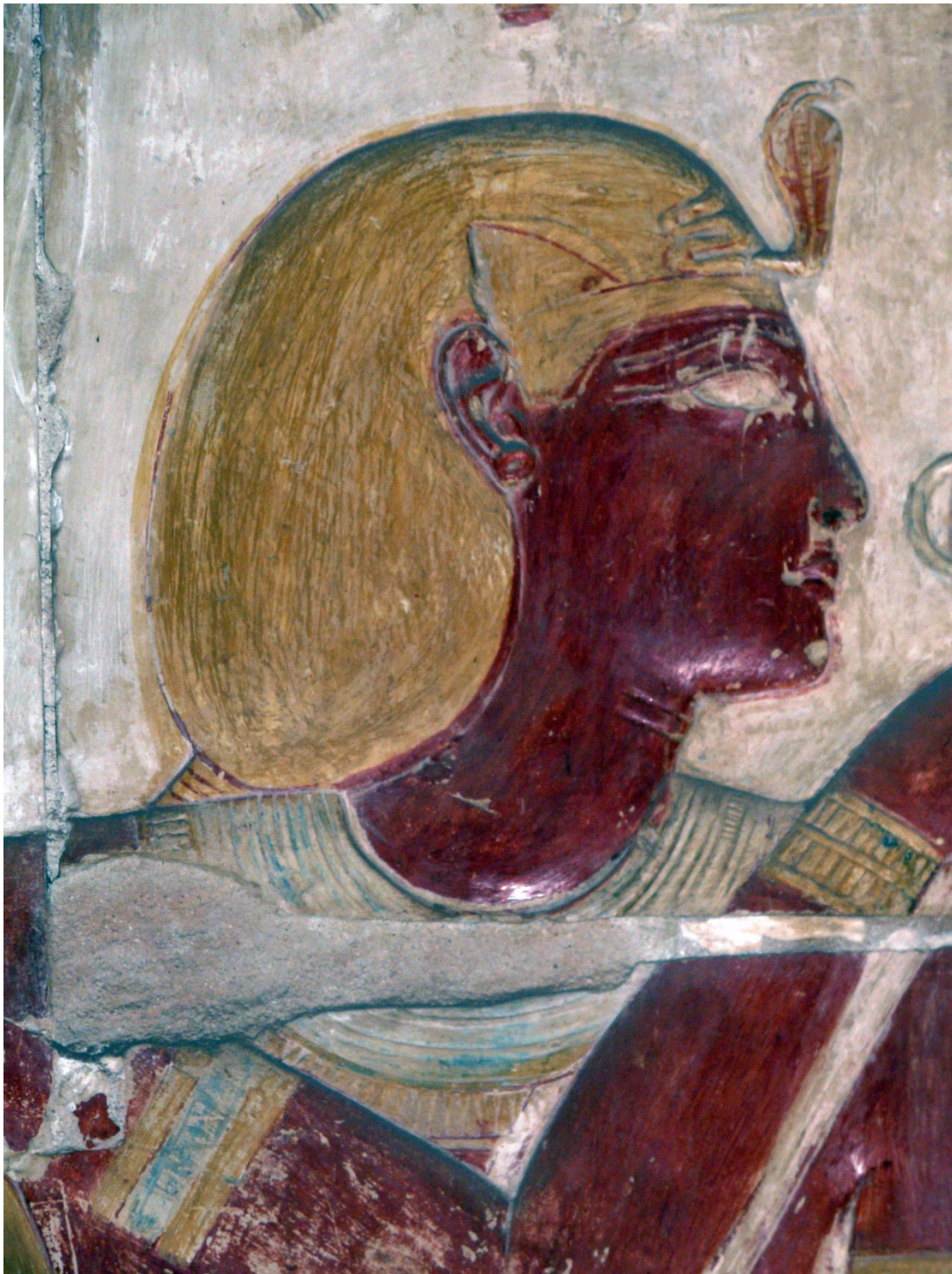
Seti I, Abydos Temple, Egypt. Circa 1300 BCE.