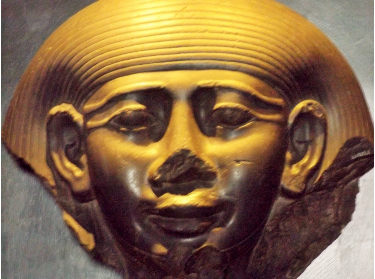
An unknown figure in Late Period Egypt. Date unknown. Egyptian Museum, Vatican.