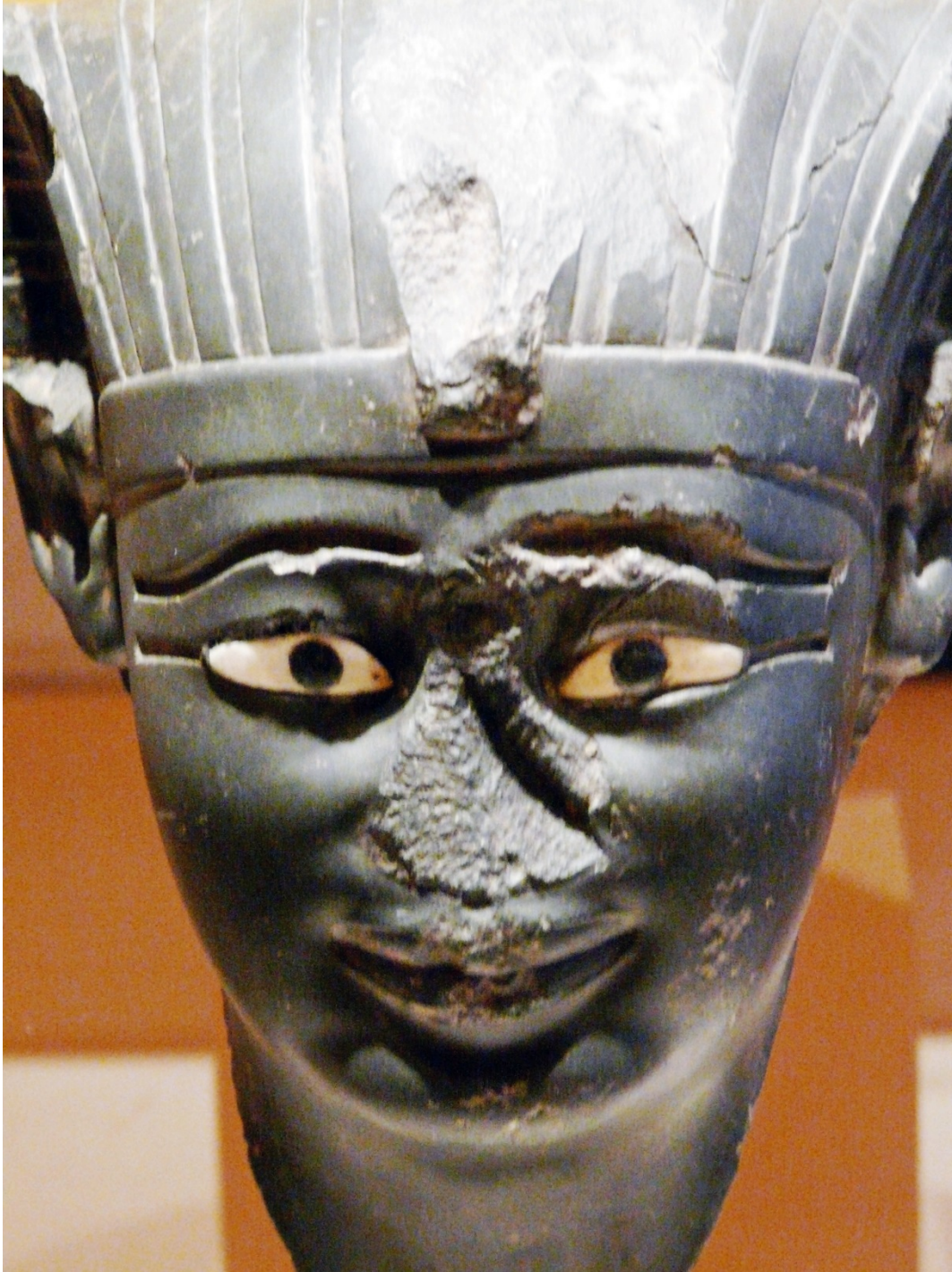
An unknown pharaoh from the Middle Kingdom, circa 2000 BCE. Musée du Louvre, Paris, France.