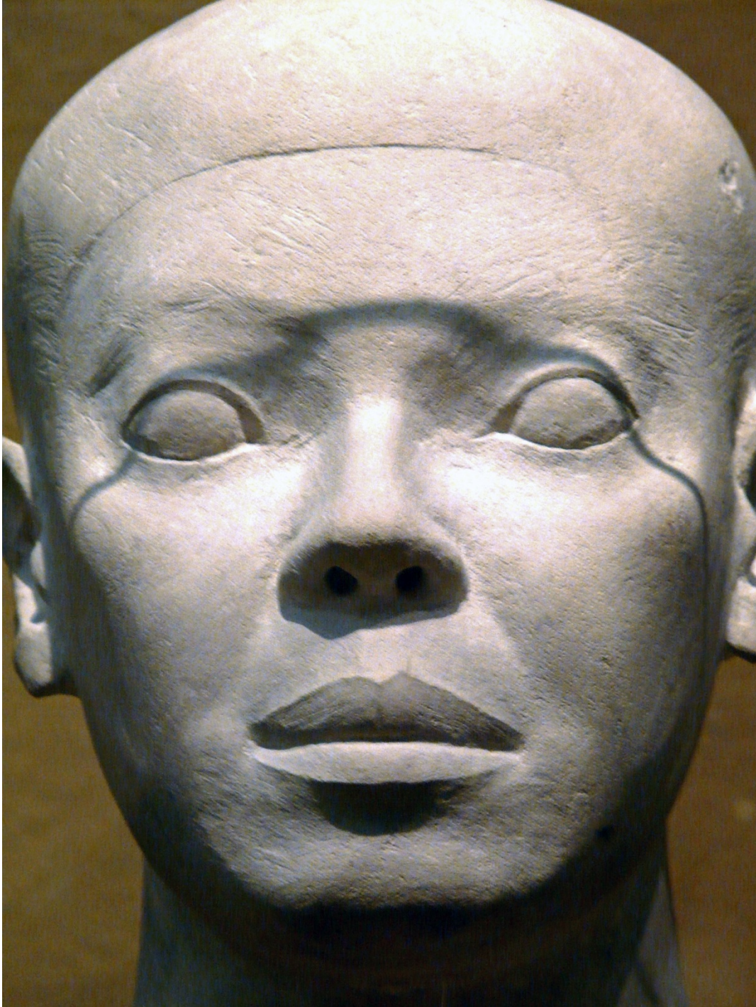
A princess from Dynasty IV. Boston Museum of Fine Arts, Boston, Massachusetts.