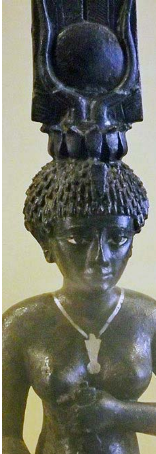
Khreduonkh, mother of Imhotep. Musée du Louvre, Paris, France.