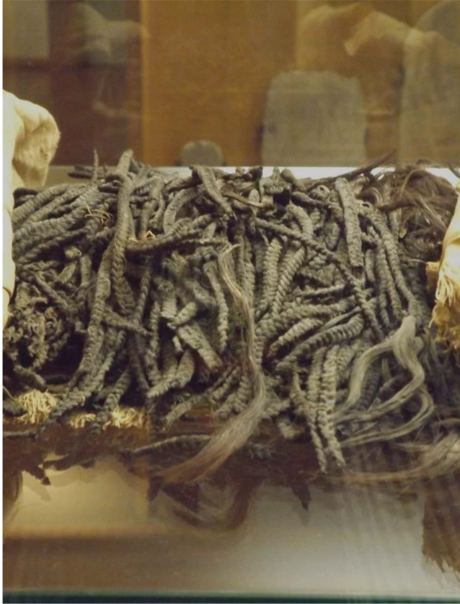
Hair extensions. Circa 1300 BCE. Archaeology Museum, Florence, Italy.