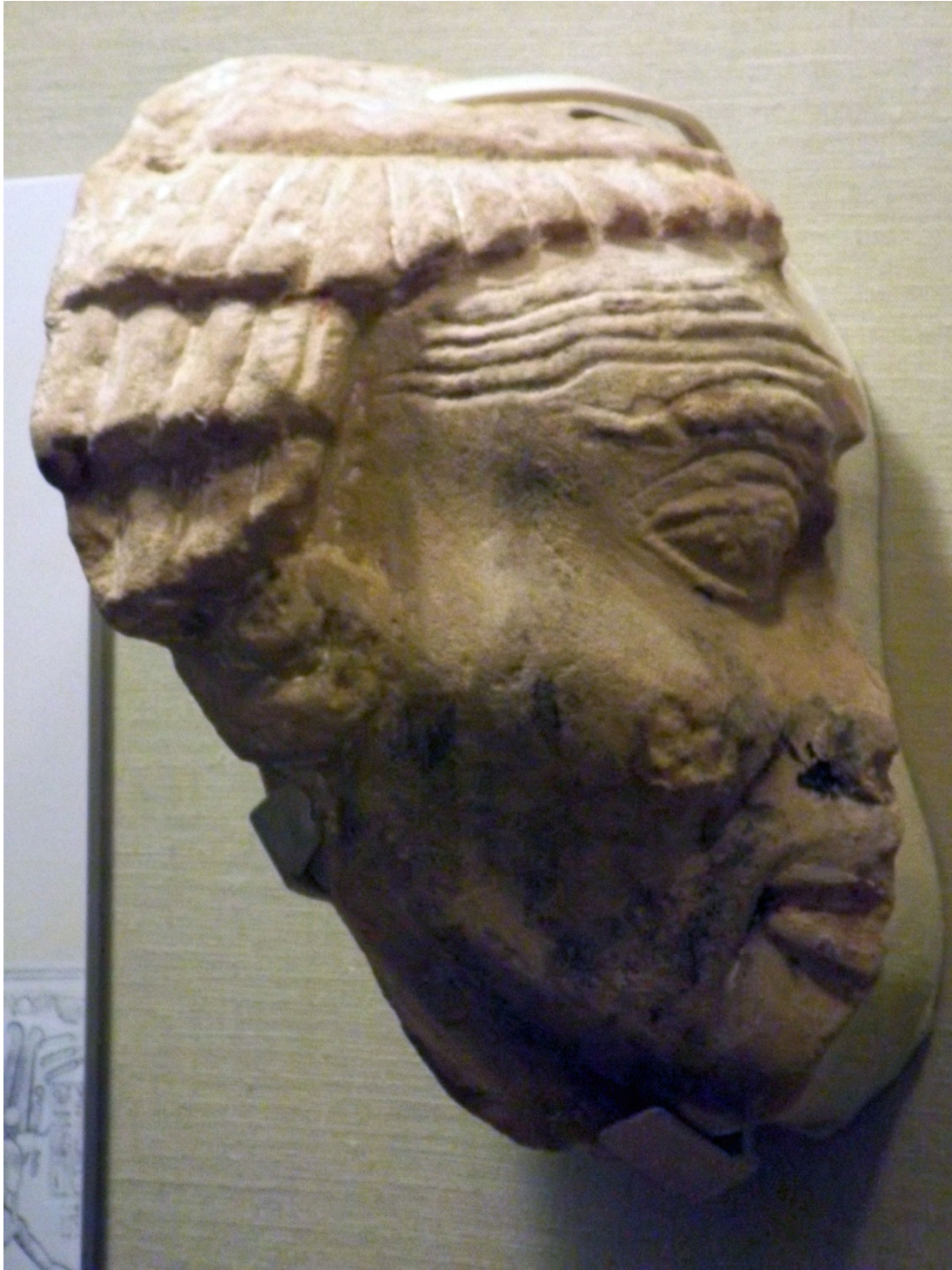
A Kushite. Date unknown. Oriental Institute, Chicago, Chicago, Illinois.