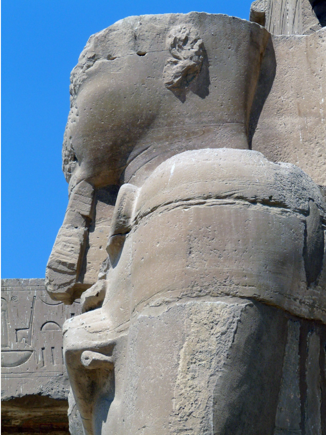
A statue of Usemare II at the Ramesseum temple in Luxor, Egypt.