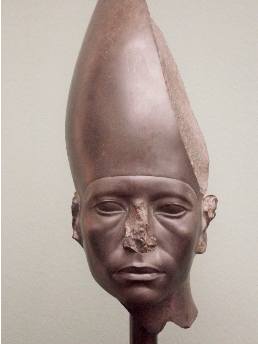
Nymare Amenemhet III, circa 1800 BCE. Ny Carlsberg Glyptotek, Copenhagen, Denmark.