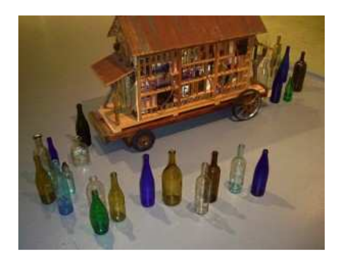
Sweat Equity" by Dominique Moody (Figure 6)

Dominique Moody is a visual griot, an artistic storyteller whose imaginative use of found objects and rubble from the streets of Los Angeles and elsewhere has propelled her into the front ranks of contemporary African American artists in the early years of the 21<sup>st</sup> century. Triply marginalized as a black woman with a major visual disability making her legally blind, Moody has nevertheless transformed trash into treasure by assembling the remains from architecture, tree branches, bottles, discarded shoes, and other everyday items into some of the most engaging artworks in the contemporary era. Her three-dimensional pieces explore her personal and family history that reflects her nomadic history from her birth in Germany in a military family through her odyssey of living at more than 40 addresses in various locations throughout her 54 years. Her works are simultaneously individual and social and make her the heir of some of the most influential African American artists of recent times.