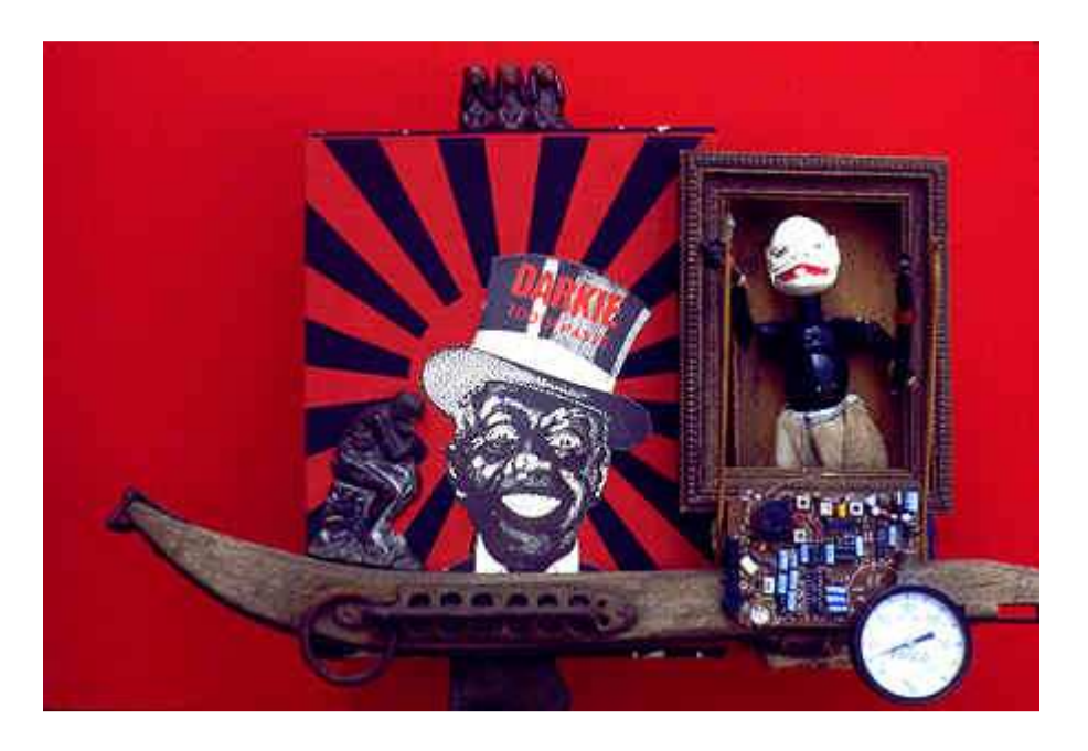
"The Thinker" by LaMonte Westmoreland (Figure 4)

The central figure is the wide-eyed, dark skinned black male with a top hat who adorned "Darkie Toothpaste" for many years—the quintessential example of commerce promoting an egregious racial slur. Significantly, this product continues to be marketed throughout Asia under the scarcely different label "Darlie Toothpaste." To the right is yet another, even more absurd black caricature. Westmoreland underscores the contemporary relevance of his anti-racist work with other elements in "The Thinker." The computer motherboard and a clock at the lower right of the assemblage signify that racist popular culture persists, even if not as overtly as in the past. On the top are the three monkeys, representing the proverbial maxim of 'see no evil, hear no evil, speak no evil." This striking addition is a pointed artistic reminder that denial of racism only exacerbates its pernicious impact and further widens the gap between American ideals and American realities.