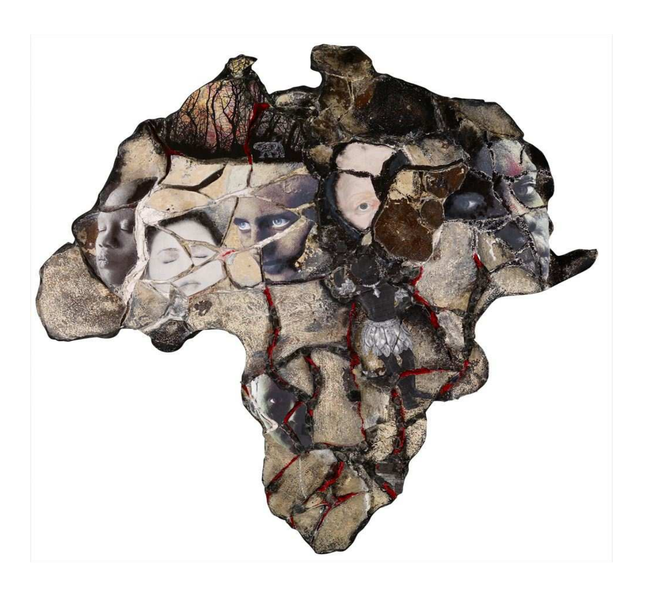
"Dear Mama" by Yrneh Gabon Brown (Figure 7).

These African American assemblage artists constitute an astonishingly vibrant contemporary community. Many even younger artists are currently emerging at the start of the century's second decade, following in the large footsteps of those who dared to recover the rubble of their communities, establishing a new standard of visual imagination and excellence. Many more are studying in art departments of Los Angeles area colleges and universities. Even more young African American artists are studying in high schools, although state and local budget cuts have curtailed both art instruction and production. When Noah Purifoy created "Sir Watts" in 1966, he had no idea that the African American assemblage movement would be among his most durable legacies. The art world and society in general are the better for it.