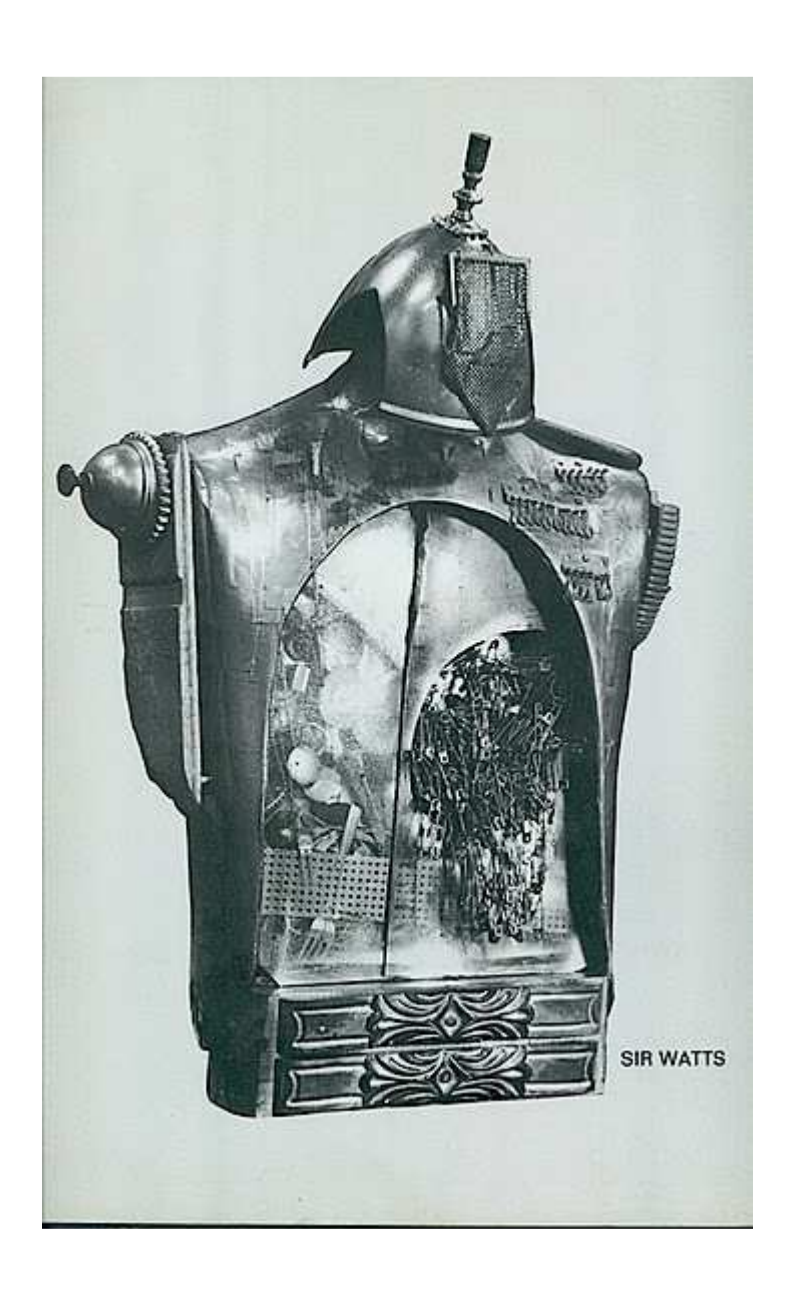
"Sir Watts" by Noah Purifoy (Figure 2)