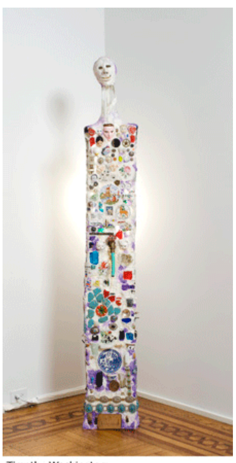
Timothy Washington Several Faces, One Race, 2009 Mixed media, cotton, glue, pigment on wire coat hanger armiture 84 1/2 x 12 x 6 1/2 inches

"Several Faces, One Race" by Timothy Washington (Figure 5),