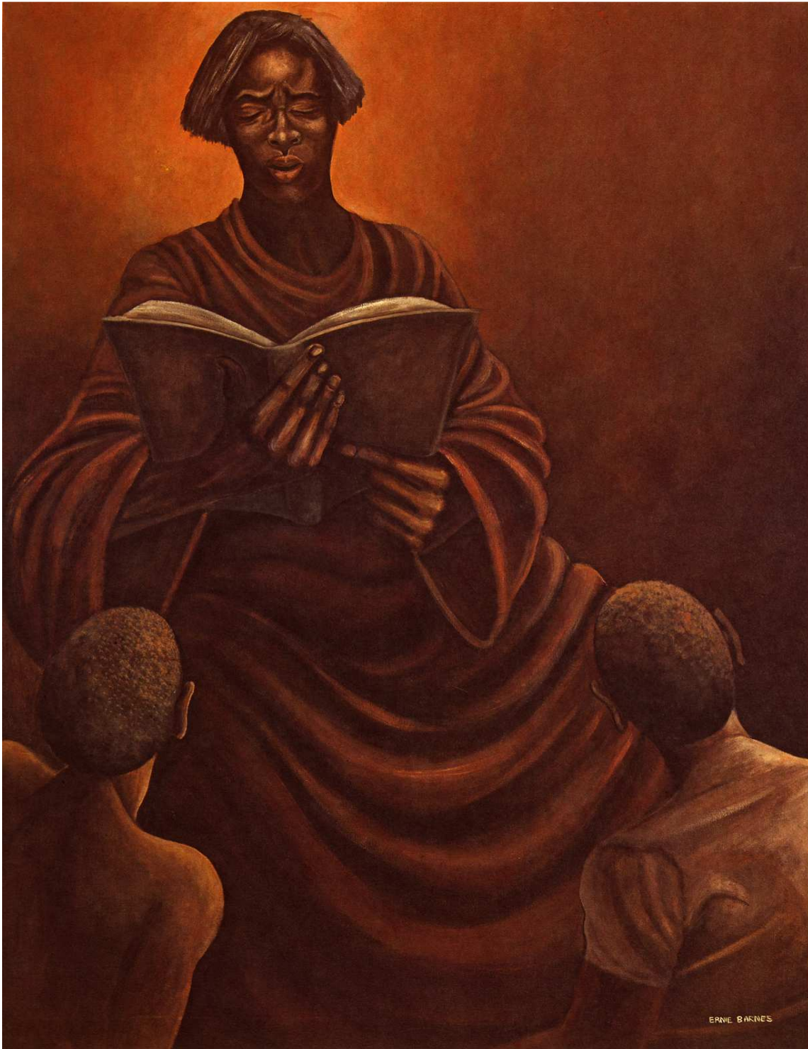
"THE STORY TELLER" © 1972 permission of Ernie Barnes Family Trust