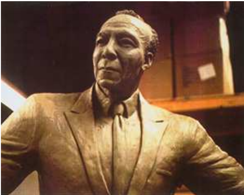
A. Philip Randolph, by Tina Allen

Tina Allen added extraordinary stature to the long tradition of African American figurative sculpture in a career cut tragically short at 59. She spent decades devoted to bringing key figures of African American history, politics, and culture to large public audiences through her skillfully crafted three-dimensional public works. From famous people like Sojourner Truth, Martin Luther King, Malcolm X, Frederick Douglass, A. Phillip Randolph, and Alex Haley to generic figures highlighting the dignity of black women and men, Allen’s sculptures were at bottom deeply educational in design and impact.