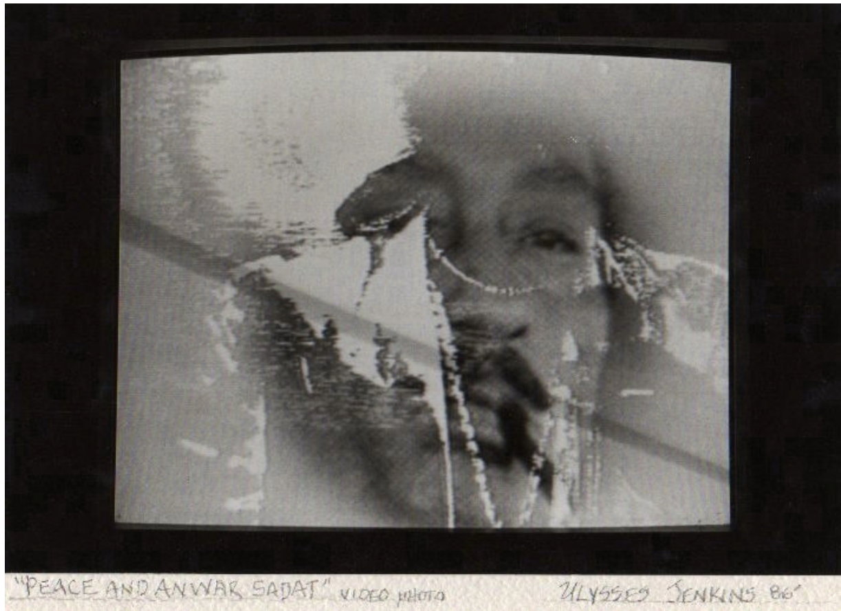
Figure 2: Anwar Sadat

Ulysses Jenkins's video works during the 1990s continued his successful quest to adapt an older tradition of poetic communication to the technology of the modern age. "The Nomadics," produced in 1991, evokes a profound view of the African origins of the artist's sustained multicultural perspective. Combining performance with music and dance, this video traces East African peoples' movements and cultural influence, linking them effectively to a convincing vision of the African sources of human civilization. The work is replete with imagery of Africans' artistic and spiritual quests and of their nomadic wanderings throughout the globe. Jenkins uses African American artist Matthew Thomas's engagingly produced sandpaintings throughout the 12-minute video as the metaphorical vehicle of cultural transmission and dissemination. Like hundreds of his African American artistic predecessors and contemporaries, Jenkins discovers and communicates the grandeur of Africa as a unifying signifier for his people's creative accomplishments. And as the African sojourners in "The Nomadics" arrive at such disparate destinations as Egypt, Mesopotamia, India, Indonesia, and Polynesia, audiences can appreciate again the linkages and similarities of all peoples in a racially and ethnically heterogeneous world.