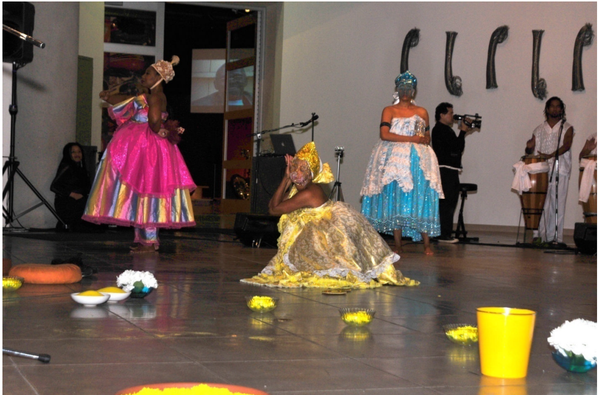
Figure 6: Quiet as Kept: Change

The most dramatic presentation of “Quiet as Kept: Change” occurred on February 27, 2009 at the California African American Museum in Los Angeles. There, in an extremely well attended multimedia performance, Jenkins projected the video on the walls of the museum building while performing musically on the stage. Concurrently, the crowd participated energetically in the evening’s events, especially in dancing throughout the main floor of the museum (Figure 6). Among many others, iconic African American artists Betye Saar and Artis Lane, both over 80 years old, joined in the robust activities. Together, this event reflected the energy of Jenkins’s artistry that culminated so effectively in that seminal event.