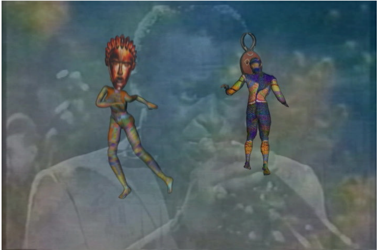
Figure 5: Notions of Freedom