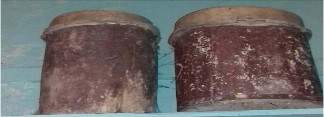
Plate No. 4. The 'bandu' and 'kyaas' Kumina drums of St. Thomas.