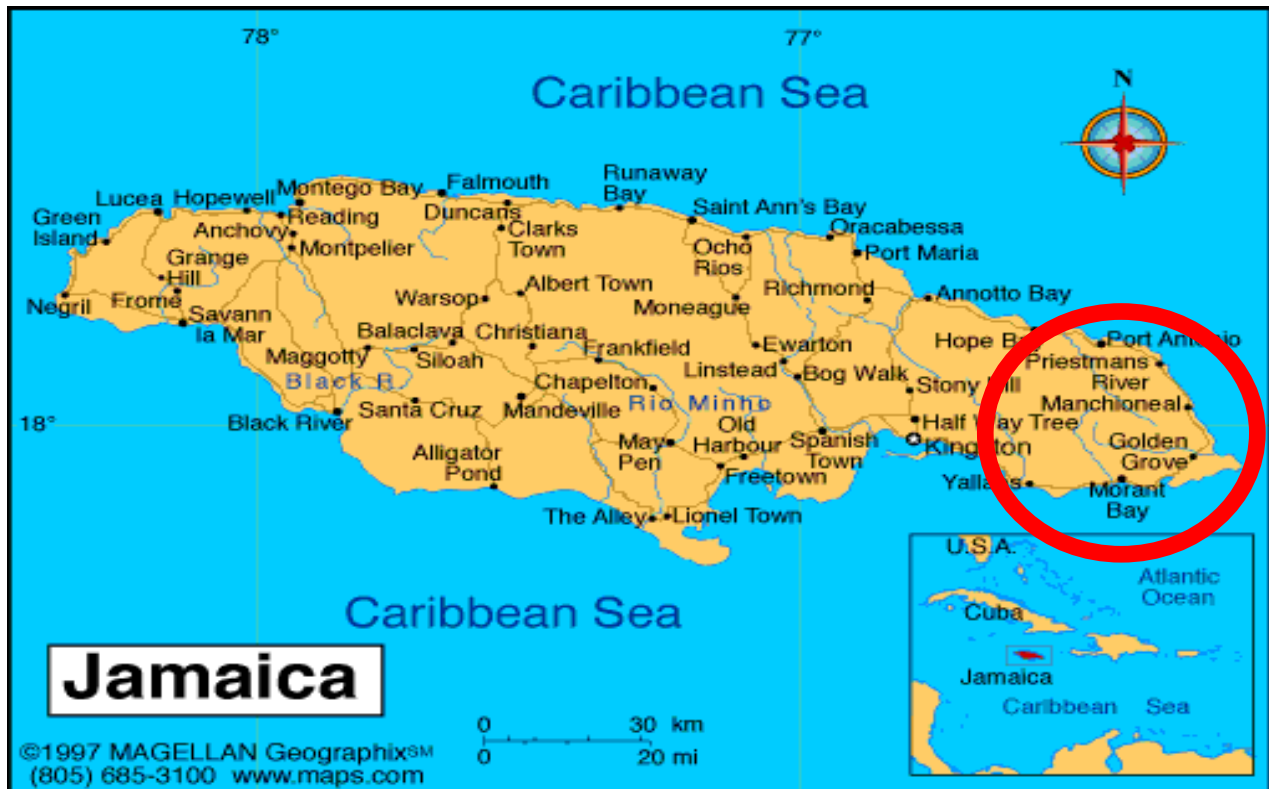
Plate No. 1. A modern ‘Map of Jamaica’ (1997)

“Well, for me, I don’t know if other womens play drums, but I was playing drums since my little brother died, that when I started playing drums.” (Informant B).