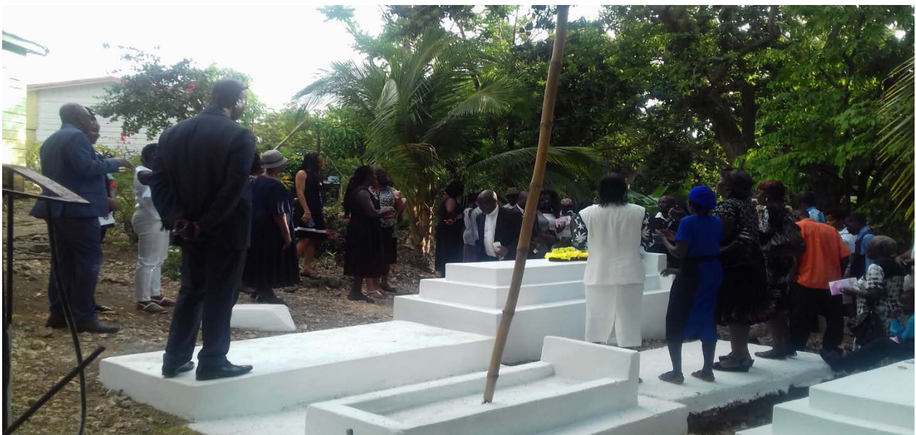
Plate No. 8. My late grandmother’s house-yard entombment service.

Burial ceremonies, “were a basic element of many societies” (Armstrong and Fleischman 2003: 61). These were later encouraged as plantation holders perceived African-based burial and mortuary ritual tied the enslaved labourer firmly to the plantation. This practice is evidenced in Jamaica, where the term ‘dead-yard’ not only refers to the dwelling of the deceased, but also to the site of interment. In Needham Pen, the ‘ Kumina -house-yard-burial’ for my paternal grandmother took place on one such site; the plot of land handed down through my father’s maternal family. This community is firmly sedimented in the cultural, historical and physical landscape as the plate below illustrates. The compound of houses in the background, also accommodates a series of centred tombs ranging back to the mid-1800s.