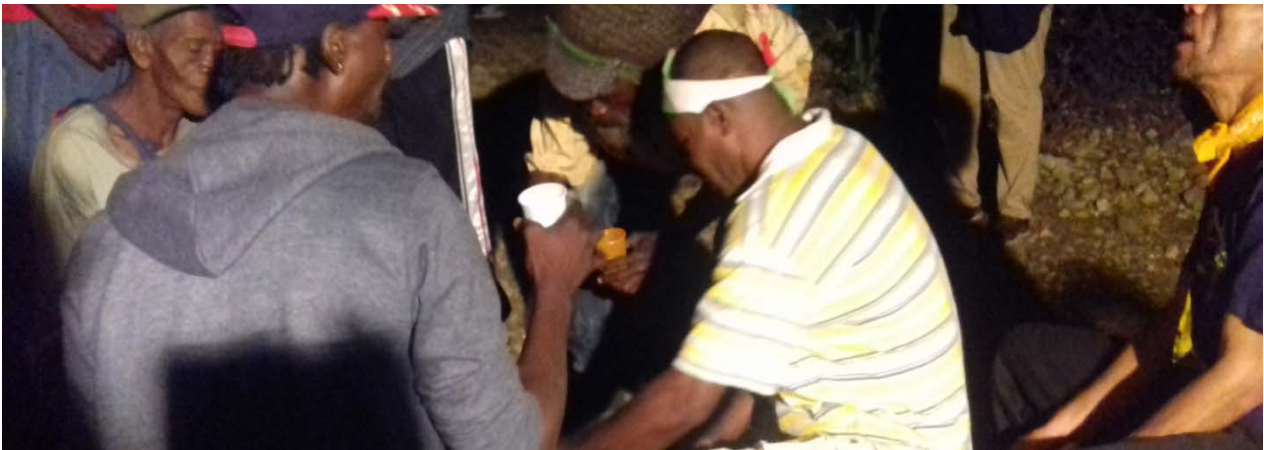
Plate No. 3. A formal ‘country’ house-yard Kumina burial

“ Kumina can take your life, save your life and help you to enjoy life.”