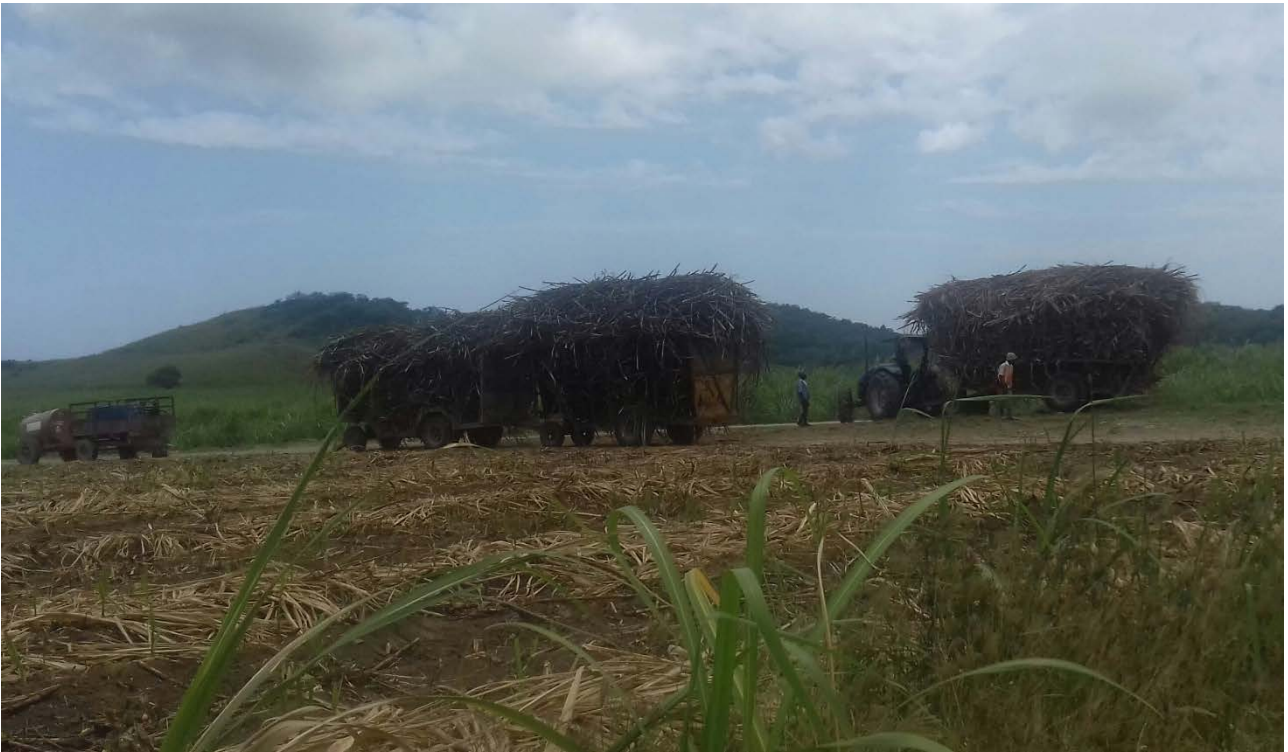
Plate No. 9. Modern sugar-cane harvesting techniques, in Golden Grove

“ Kumina is a site of African historical consciousness where the experience of slavery and African oppression are tangibly remembered through cultural institutions and the natural terrain” (Stewart 2005: 234). Plantation slavery in Jamaica was the blueprint of multi-generational financial wealth. It fuelled a system of industrialisation in Victorian Britain, and thereby rapidly transmogrified the fortunes of its city states. Further development of colonial and imperial power at the heart of mainland Britain would prompt steps towards the colonisation of Africa, and later globalisation. Kumina generates an inclusive sense of historical belonging in memory of the landscape.