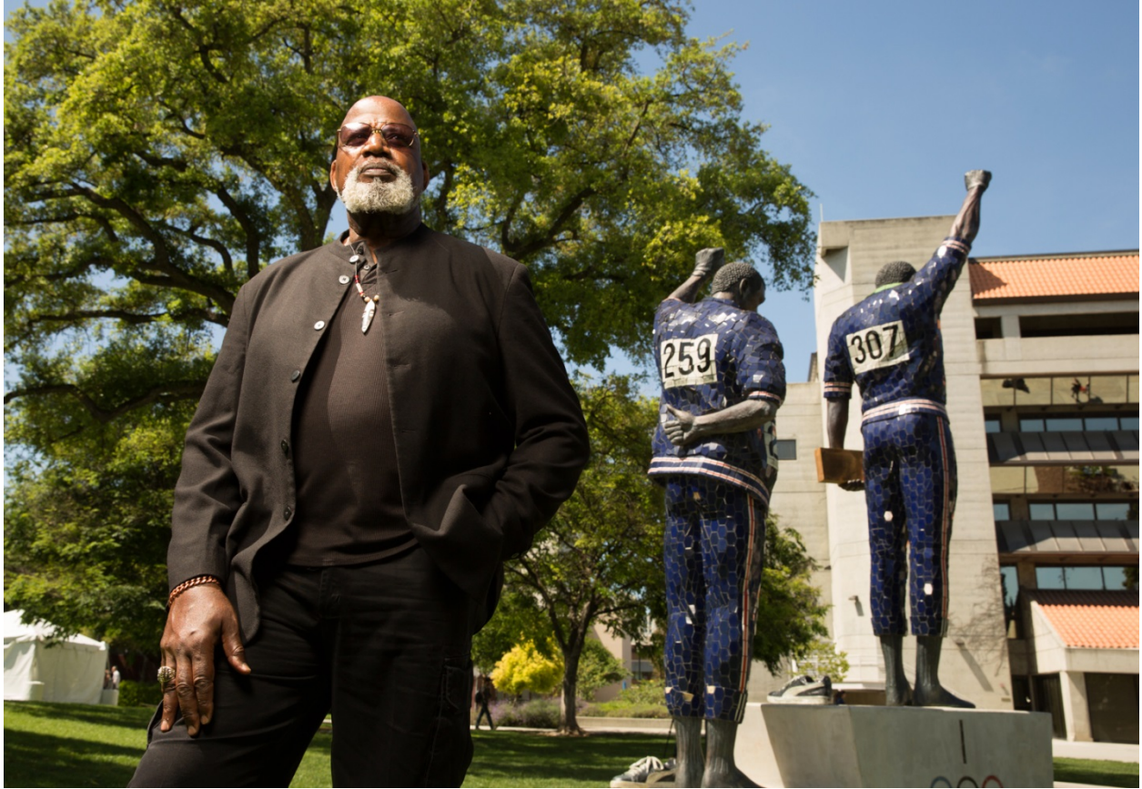
Harry Edwards at San José State University

From student-athlete to activist-scholar, Harry Edwards' life and work demonstrate that sport is a window to society, revealing a broad range of social and political concerns that affect us all. Housed in SJSU Special Collections and Archives is the Dr. Harry Edwards Collection which includes historic photos, autographed books, Olympic Project for Human Rights memorabilia, and correspondence from Dr. Martin Luther King Jr. and President Barack Obama. SJSU is also home of the Olympic Project for Human Rights organized in October 1967 by Edwards and others to protest racism in the U.S. and elsewhere (e.g., South Africa).